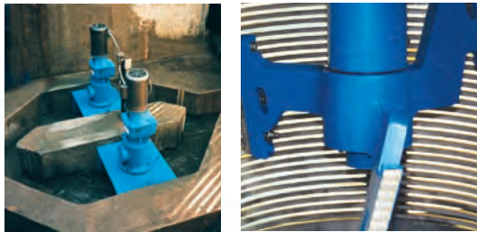
Above Left: A pair of T15's installed at plant headworks.