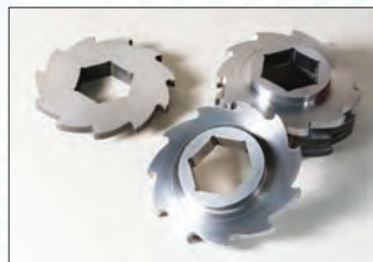
Left: Unique integrated cutter and spacer combinations enhance unit strength.