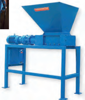
Right: The TASKMASTER TM1620 with a hopper and stand for gravity feed.