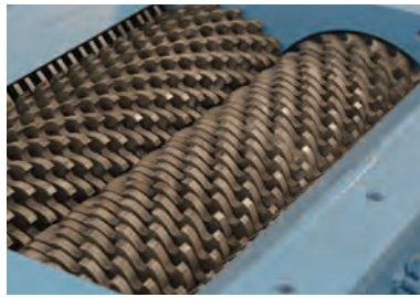
Twin-shaft cutting chamber.