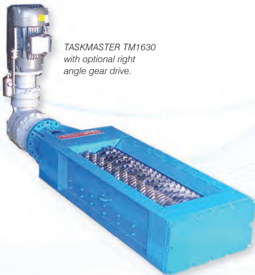
TASKMASTER TM1630 with optional right angle gear drive.

The TASKMASTER TM1600 features an open or flanged pipeline housing, 2-3/4" hardened hex shafting, mechanical seals, direct inline or optional right-angle gear drive, a choice of cutters, optional cleaning combs, flanges, stand and hopper. Units are also available in stainless steel. A model S260 Automatic Reversing Controller is supplied standard. Cutters are available with spacers as one piece for enhanced unit strength and reduced parts.