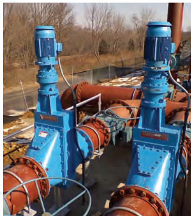
An inline TASKMASTER TM1630-18 being fed by an 18" force main.