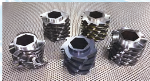
Above: Cutter Cartridges® are available in a choice of profiles for desired performance.

The TM8500 can be configured for gravity feed, open channel or pipeline applications. Motor-driven units are supplied with a heavy duty, direct coupled gear drive. Optional configurations include shaft extensions, hydraulic drives or submersible explosion-proof motors. The TASKMASTER can be provided with guide frames for mounting to channels or wet wells, or with hoppers and stands for gravity-fed applications.