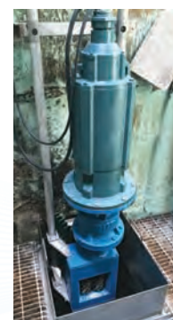
This grinder is utilizing a submersible (IP68) motor.