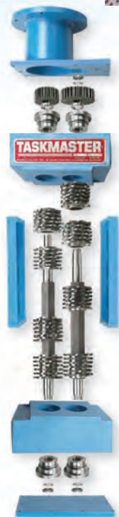
Left: The TM8500 features fewer moving parts for easy maintenance and durability.