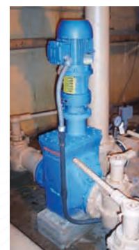
A TASKMASTER inline grinder with flange housing.